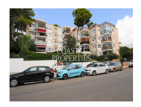
2 Bedrooms | 1 Bathrooms