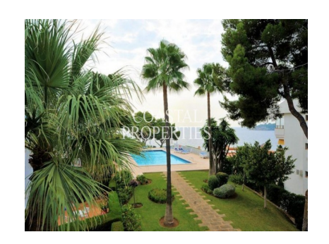
2 Bedrooms | 2 Bathrooms